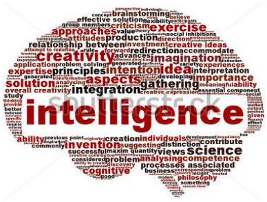
Figure 1.Example of Intelligence

Human intelligence is the ability of humans, categorized by perception, consciousness, self-awareness, and volition. It allows humans to recollect imageries of things and practice in upcoming behaviors. It is a reasoning process which allows humans to get knowledge and think [3].